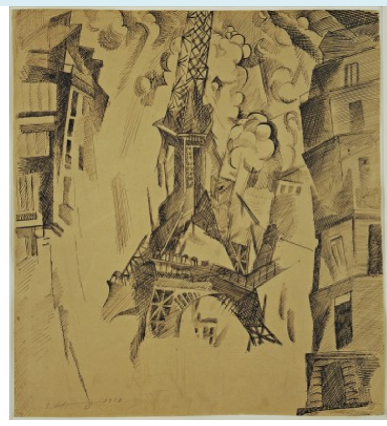
The Tower, 1910

André Masson began automatic drawings with no preconceived subject or composition in mind.