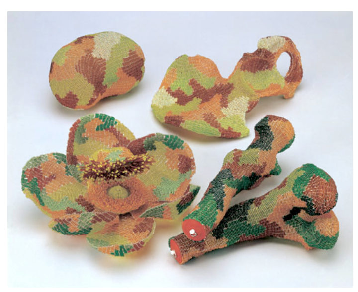
Fiona Hall, "Understory".