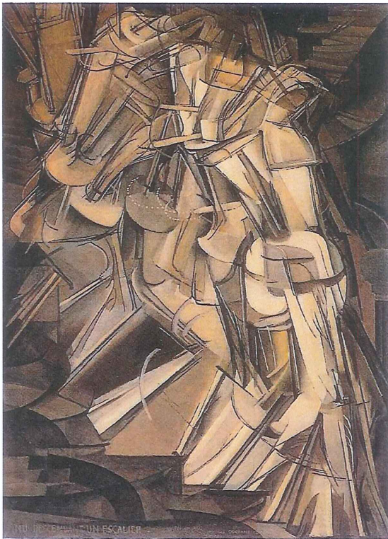
Figure 1: http://artelectronicmedia.com/artwork/nude-descending-a-staircase